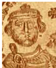
620 AD Heraclius