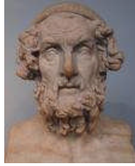
750 BC Homer