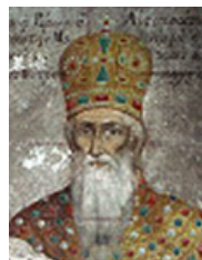
1300 AD Andronicus II Palaeologus