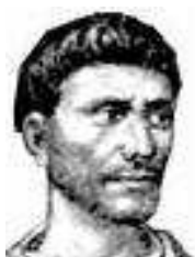
250 AD Diophantus