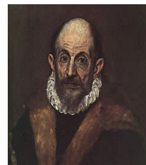
1610 AD Domenikos Theotokopoulos (El Greco)