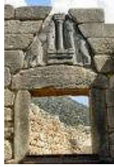
1150 BC Ruins of Dorian Invasion