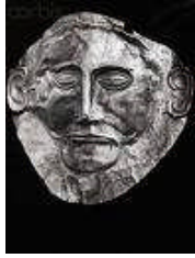
1500 BC Mycenaean Mask