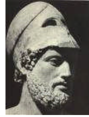
450 BC Pericles