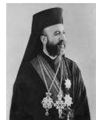
1960 AD Makarios